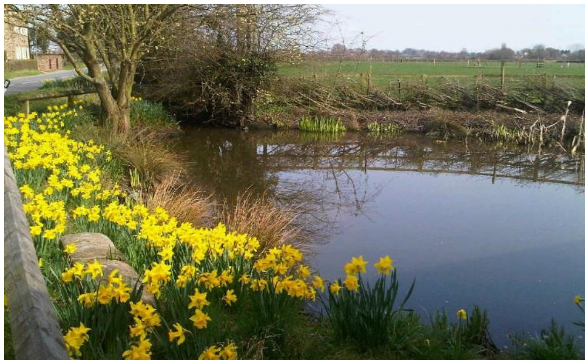
The Village Pond at Eastertime