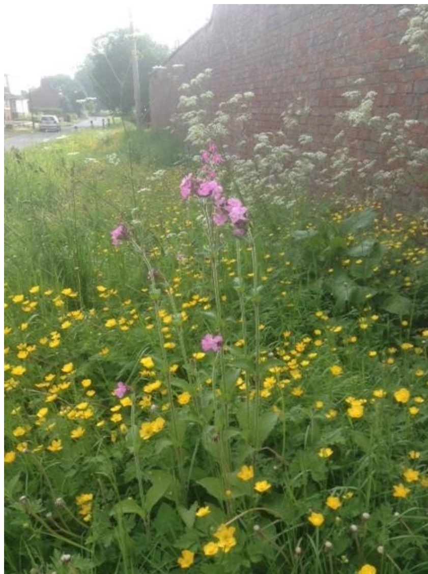
Moor Lane verge: Red Campion amongst Creeping Buttercup with Cow Parsley in the background